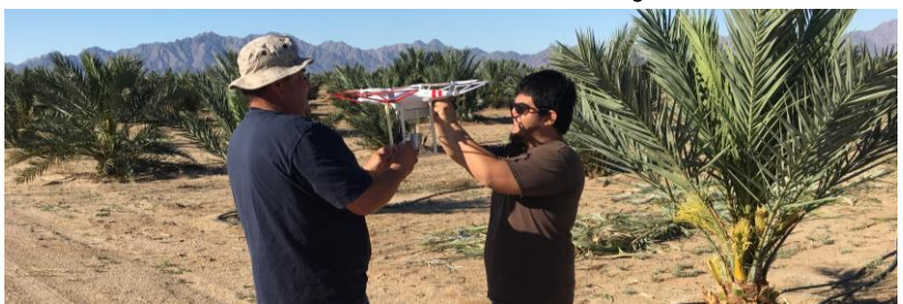
UA students prepare to test the drone pollination design prototype