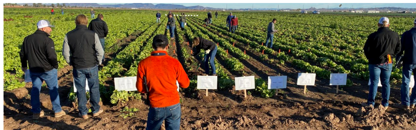
Participants of the Fusarium Wilt of Lettuce Field Day look at the variety field trial.