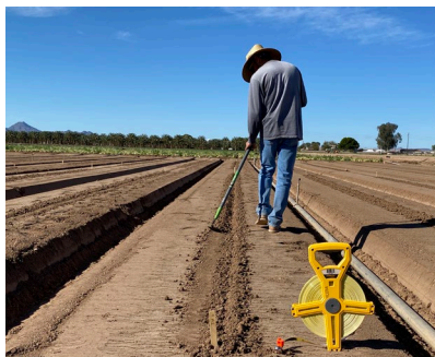
Planting the Year 3 melon variety trial.