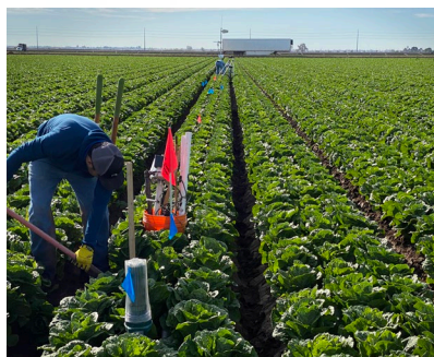
Soil moisture sensors in the field